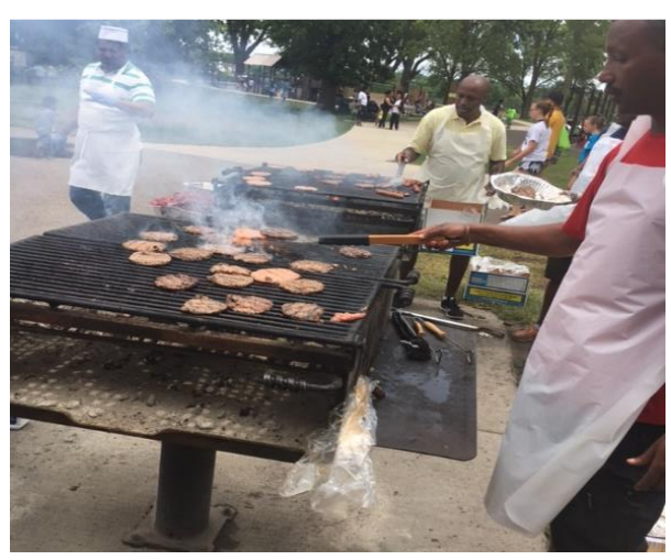
Annual Church Picnic chefs busy at preparation of meals & and others cooking