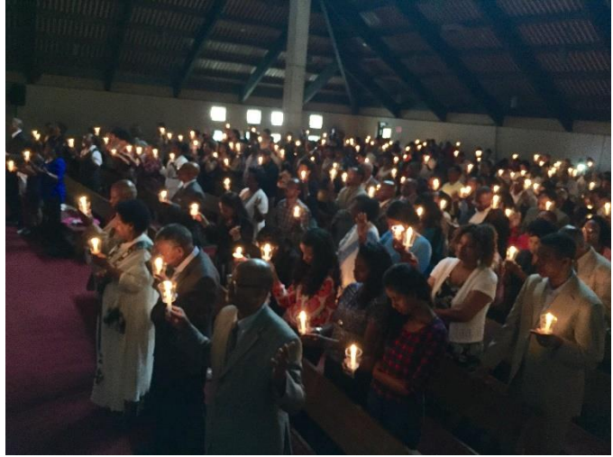
Sunday, 09/04/2016 candlelight vigil for our people in Oromia at OROECM

streets, schools and work places etc. What makes this day, Sunday, 09/04/2016 a special prayer day is the killings of prisoners who were trying to escape into the compound of the prison from their burning cells, a 3 sections buildings of the Qilinxoo, maximum security prison. Here, it is said that thousands of prisoners are held, an estimated 90% of them Oromos, where someone, a non-Oromo once wrote, "the Prison speaks Oromiffaa" (Oromo).