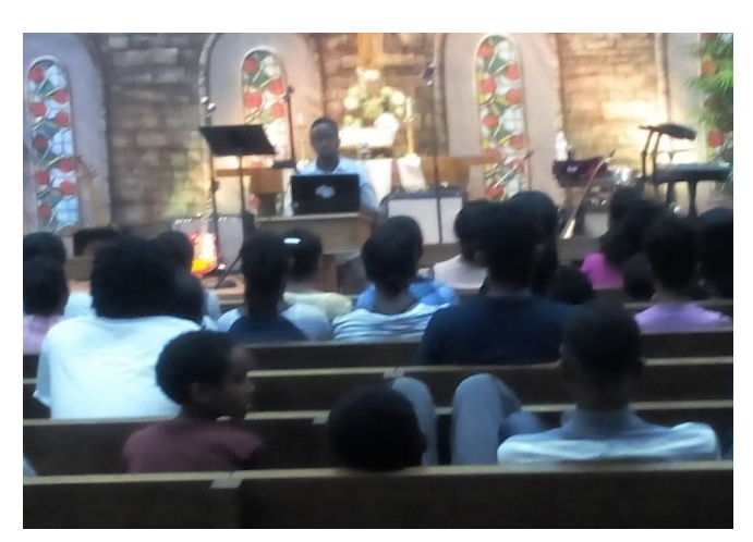
One of the presentations

singers and a keynote speaker helped us to achieve the goal desired. Workshops, presentations, and music were also part of the conference.