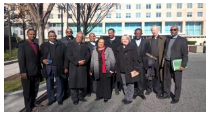
UOEC Pastors and Partners

Pastors from several United Oromo Evangelical Churches, UOEC went to Washington DC, from 14-15 January 2016 on advocacy mission to draw attention to the severe human rights violation against our people, Oromo people and to appeal for humanitarian interventions.