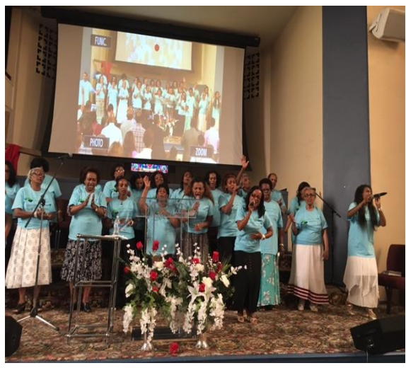
Online Prayer Group Choir singing at the UOEC Conference.

Finally, the application by Oromo Evangelical Churches of Columbus Ohio to host the 2017 UOEC 22<sup>nd</sup> Conference was discussed and provisionally approved on condition that the two Columbus, Ohio Oromo Churches; the Oromo Evangelical Church and the Oromo Evangelical Lutheran Church go back and work on how to host the Conference together and inform the Board within 4 months (by mid-November 2016) if they have come to agreement. If not in agreement to host the conference together, the chance we will be given to another church at the board's decision.