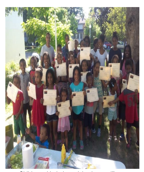
Children with their participation certificate