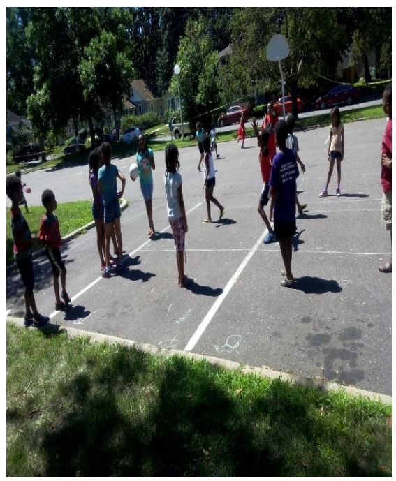
Children playing in the OROEC parking space

Day Bible Camp is intended to nurture our children with age appropriate spiritual experience during their summer vacation. Children from Pre-K to 4th grade attended Day Bible Camp at the OROEC from July 25-29, 2016. The participation of our youth and parents who volunteered made this Bible camp successful. Their daily schedule comprised worship, hearing Bible story, small group time, indoor activities, and field trip. All children visited Science Museum and Como Pool on different days. It was a blessing experience for our kids to learn, share, worship, play together, and discharge responsibilities in the church during their time together. It also contributes a lot to strengthening a sense of belonging together and Christian fellowship at this early age in their life. They had barbeque and certificate award for the closing ceremony.