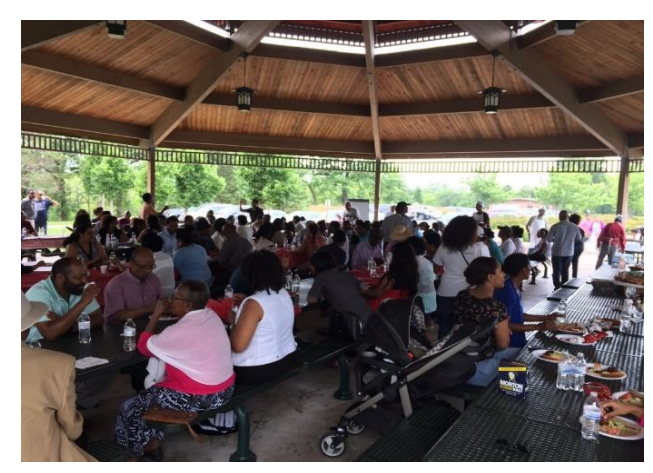
Partial view at the picnic field