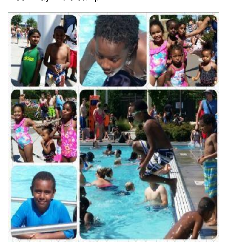
Children enjoying their Day Out in Swimming Pool.

A big thank you to all of our summer program participants, parents, youth group, and church leaders for helping to make the Day Bible Camp & Wapo Bible Camp a success. We had around 43 children who participated in the Wapo Bible camp for one week and over 50 children from pre-school to fourth grade who attended the one week Day Bible camp.