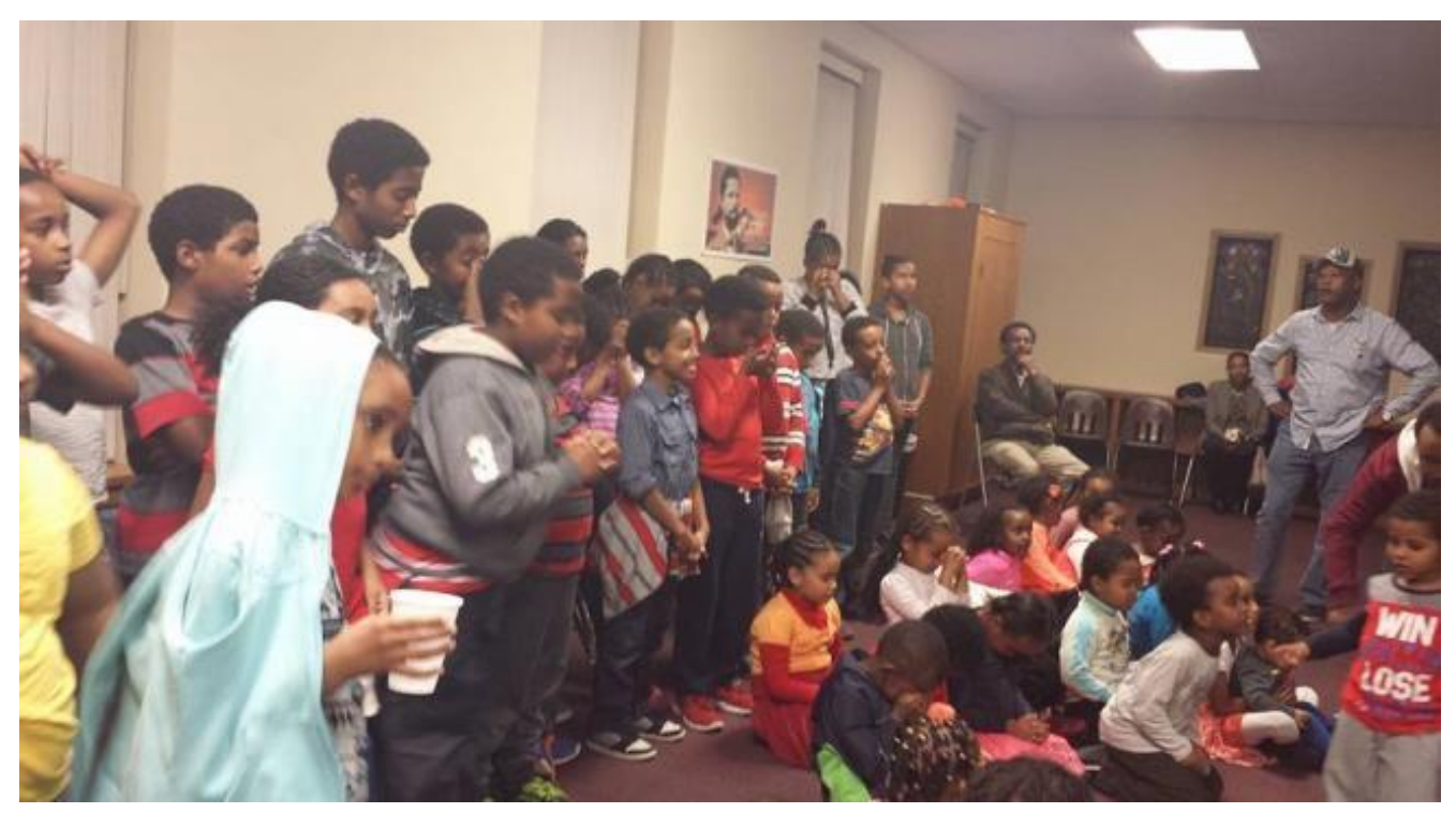
Hallelujah Night at OROECM

It has been several years since OROECM renamed the Halloween Night as Hallelujah Night and started organizing the yearly October 31<sup>st</sup> celebration with appropriate program for the children of our church and their parents. This year close to eighty children and parents participated in the program of singing and fun for the children