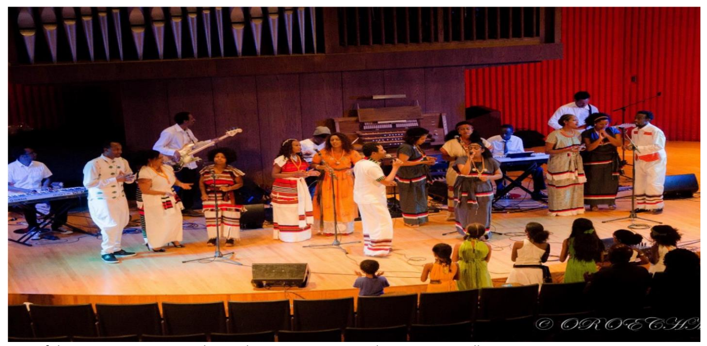
One of the many presentations during the concert at Concordia University Hall

A Spiritual Music Concert was organized by our church Worship Team held at Concordia University on. Well known Oromo spiritual singers participated in the concert, the first of its kind. It turn out to be a successful event and one of the means of outreach to our Oromo communities in the Twin Cities area.