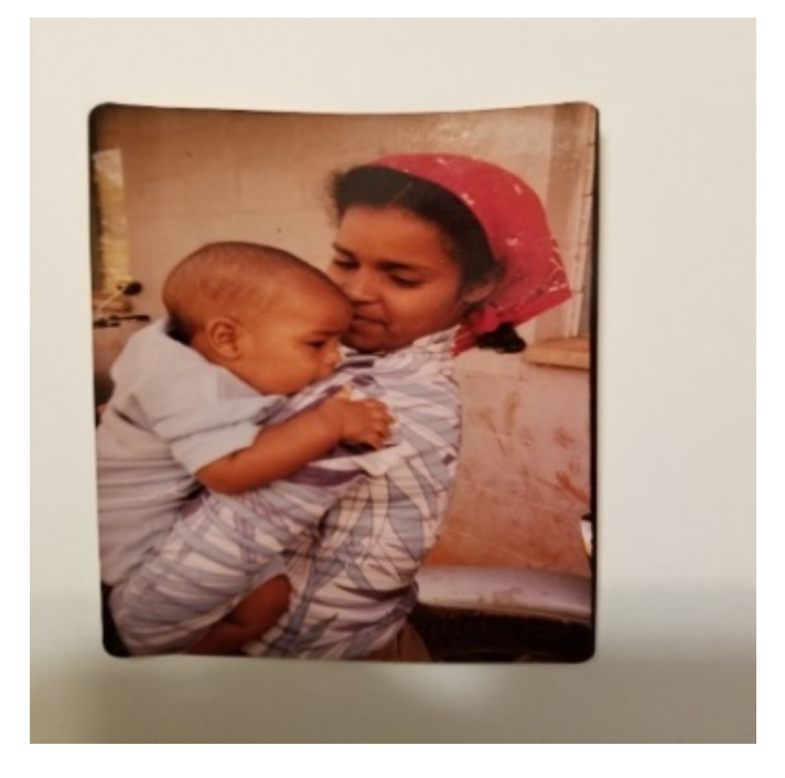
A young Oromo mother with her baby boy.