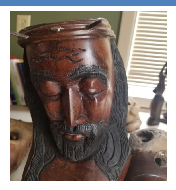
A crown of thorn crafted by an African artist (Malawian) from African wood depicting the suffering of the Lord, Jesus

The Lord was betrayed by one of His own disciples, taken before the Roman colonial governor of Judea Pontius Pilate by Jewish religious leaders for trial and crucifixion. Although he knew that Jesus was innocent Pilate failed to exercise his authority and free an innocent man because of his indecisiveness, instead he washed his hands symbolically claiming that he had nothing to do with what would follow against Jesus.