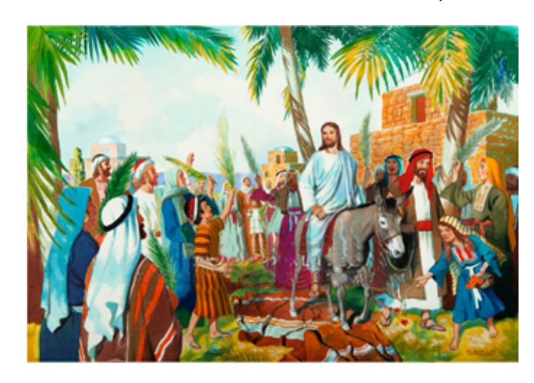
"Rejoice greatly, O daughter of Zion; shout, O daughter of Jerusalem: behold, thy King

In conclusion the colt (the young donkey) was in a way honored by the Son of God riding on it, the donkey walking on the cloth and palm branches the people spread on the road for the Lord's honor, fulfilling the several century old prophesy in Zechariah 9:9. Actually, it seems the Lord already knew the donkey before even seeing it; because He instructed His disciples saying, (go and fetch it, it was tied on the side of the road, if anyone asks you why you take it, tell him that the Lord needs it, Luke 19:31).