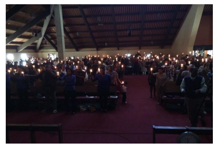
Candle light vigil at OROECM for the fallen Oromo young people.

rights of peaceful gatherings and expressing their grievances publically. The young people and their parents were robed their future mercilessly and cannot be repaired.