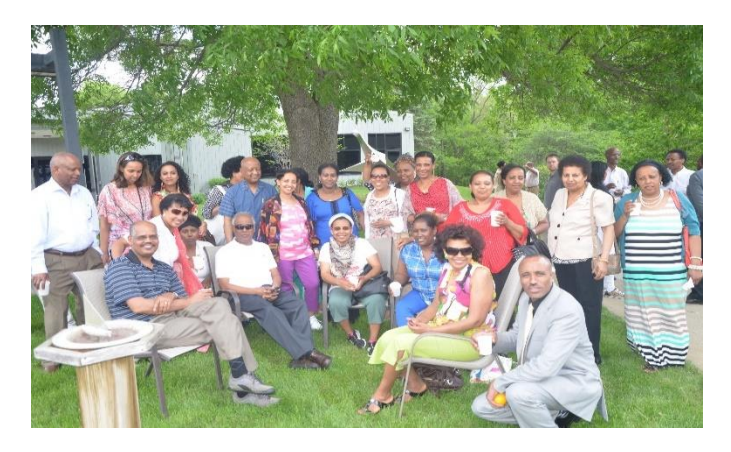
One group posing for a picture outside retreat center with the Pastor at the center.

It was a fruitful one day intensive working retreat. OROECM is grateful to Mt Olivet Lutheran Church retreat center for allowing us to use the facility without any cost to our church.