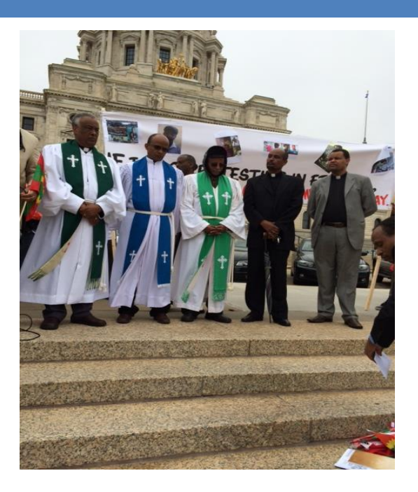
Oromo Churches Pastors in the Twin Cities area at the gatherings at Minnesota State Capital

On Friday 05/09/14, demonstration was organized by the Oromo Community in Minnesota at the Minnesota State Capital. Our congregation members, led by our pastor, joined the rally. OROECM pastors appeared dressed in their pastoral vests and joined other Oromo church leaders from the Twin Cities area and the Muslim and Waaqeffataa religious leaders. Words of encouragement and prayers for peace were made by the Pastor, people affirmed to pray for and stand by all oppressed people facing injustice, in current instance our Oromo People.