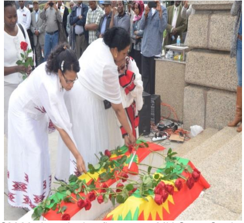
OROECM Mothers laying flowers at MN State Capital in remembrance of the killed Oromo Children.

After the program at the church the mothers and some members went to the State Capital where they laid the flowers that they were given at the church for the Mother's Day in honor of the fallen young people of Oromia. They wept, they sang spiritual song and again the Pastor gave short and wonderful words of encouragement .