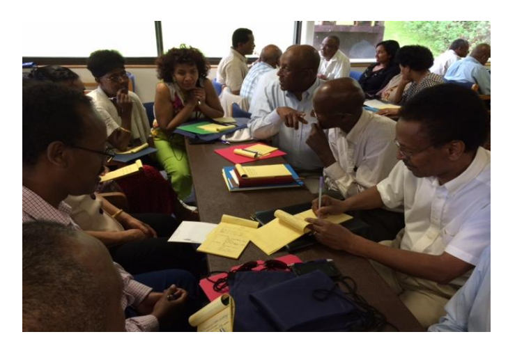
Partial view of groups in working session.

The working retreat covered various topics on the current ministries of our church and its future vision for the next 5 to 10 years.