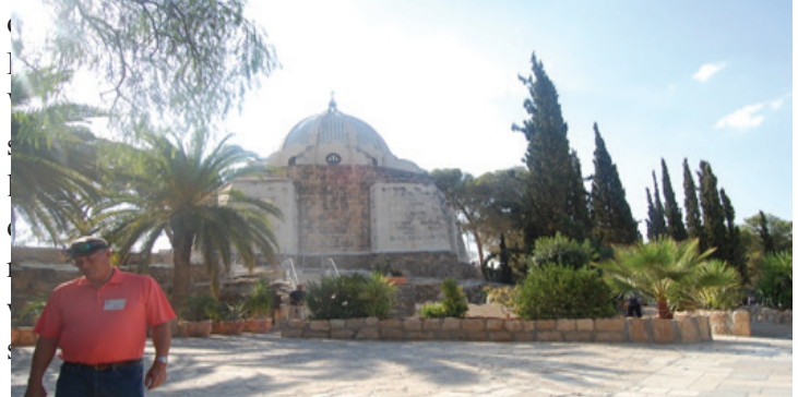
Shepherds' field church (Taken during Holy Land Tour-Nov, 2012)

Israelites did not understand that the Kingdom of their Messiah was not meant to be of this world nor limited to liberating