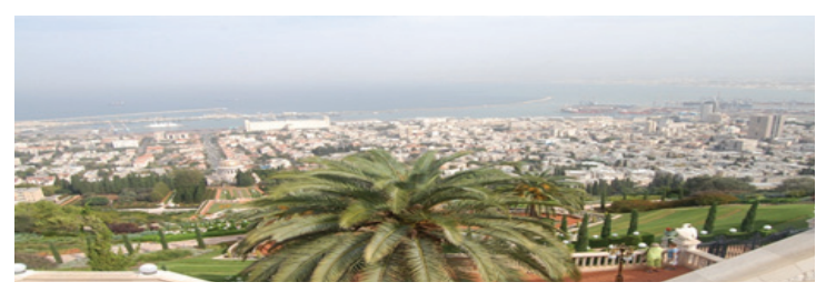
Harbor view of Haifa

From Caesarea, we drove to Megiddo to visit the museum, ruins of the city and Solomon's Stables and then to Haifa to ascend Mt.Carmel (where Elijah killed Baal's priests-1Kings:18) to view the sea and the harbor. Also Carmelites Monastery and Elijah's cave were one of the interesting areas visited.