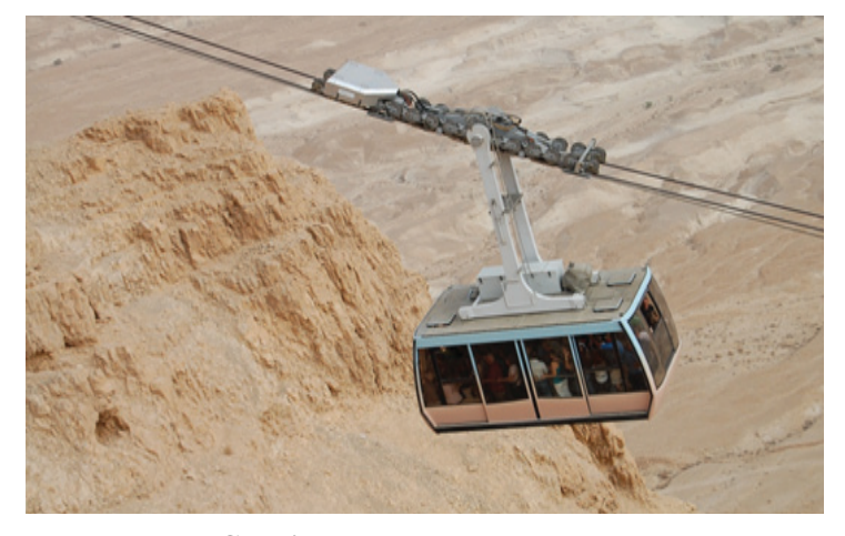
Crossing to Masada by cable car

the Dead Sea Scrolls were discovered. On the east side of the Dead Sea are the Moab Mountains and Mount Nebo where Moses viewed the Promised Land.