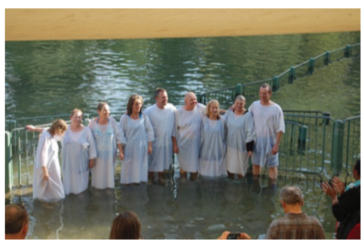
Many Christians renew their baptism in the River Jordan

We also saw the site of historical stronghold of Masada where we ascended by cable car to the fortress where 967 Zealots (Jews) made their last stand against Rome in 73 AD and back to Jerusalem.