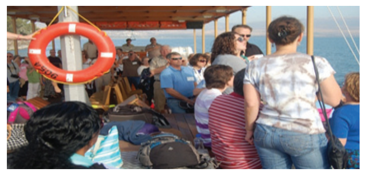
Crossing to Capernaum (On the Sea of Galilee)

On the third day of our visit, we crossed the Sea of Galilee on boat to Capernaum which was the center of Jesus' ministry in Galilee. From Capernaum we continued to Tabgha, which was the site of the Miracle of the Loaves and Fishes. Then we continued to Mount of Beatitude where Jesus preached the famous Sermon on the Mount and chose the Twelve Apostles, (Mt.14:13-21, Mk.6:30:-434; John.6:1-14).