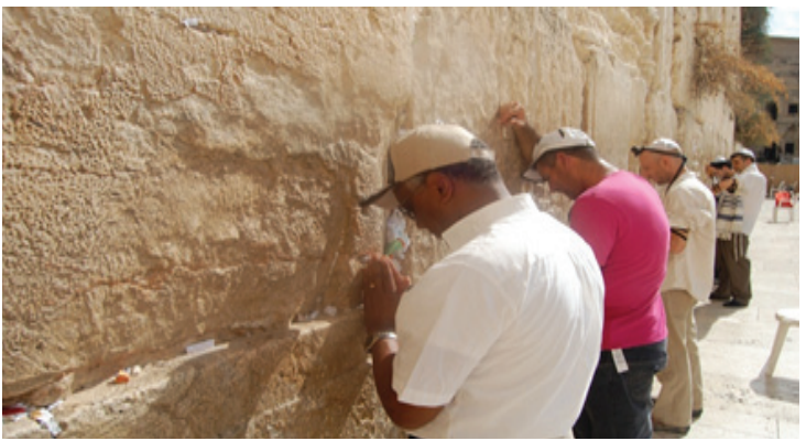
Prayer at the Wailing Wall is common for tourists

Starting from the fifth day of our tour, we stayed in the city of Jerusalem and made walking tours as most of the historical sites are close to one another. We visited the Temple Mount and the Pool of Bethesda where Jesus healed the crippled man as well as Dome of the Rock, the El Aqsa Mosque and the Wailing Wall (Western wall). Numerous historical monasteries and churches were also one of the interesting sites we visited.